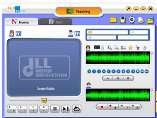
New user interface

With a view to having a more easy-to-use GUI (Graphical User Interface), we have combined the manual & normal modes while keeping most of the buttons unchanged so that a balance could be struck between being user-friendly and adaptability by existing users of older versions